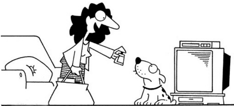
"Cats—the fragrance for dogs who dare to be different!"

(Some facilities advertise that they are, when in fact only portions of their building have traditional air conditioning.)